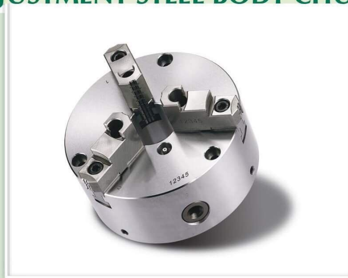
規格表 » Specifications