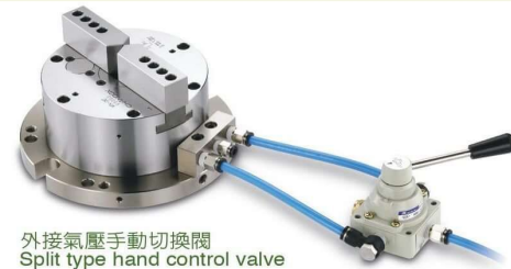
外接氣壓手動切換閥 Split type hand control valve

氣壓切換閥連接方式 / 特殊附件 Examples of Attaching Pneumatic Manual Switch / Optional Accessories