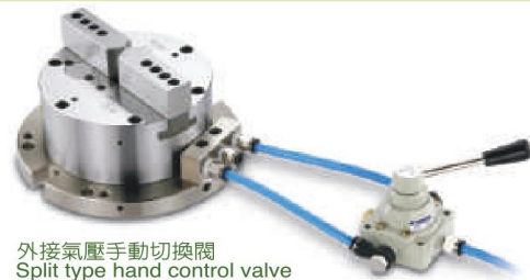
外接氣壓手動切換閥 Split type hand control valve

Examples of Attaching Pneumatic Manual Switch / Optional Accessories