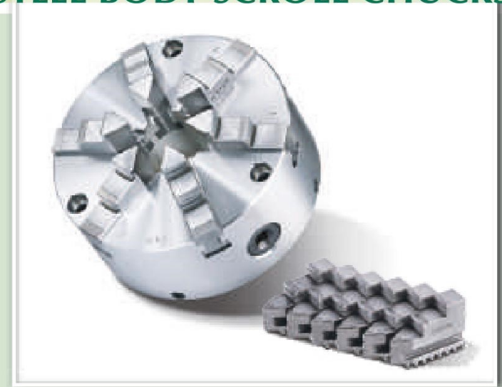
規格表 » Specifications